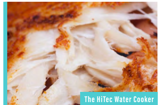
The HiTec Water Cooker

At the product inlet there is a propelling adjustable water flow, this is towards the outlet side, the flow ensures a constant water temperature and product distribution at the inlet at the formed products. The pump tray on the outlet side is fitted with a coarse filter. Automatic water level control by means of radar sensor. This allows the water level to be infinitely adjusted.